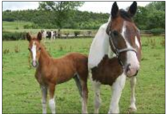
Lot 19 - Rosehall Limelight - Filly foal by B. Stepping Stripe