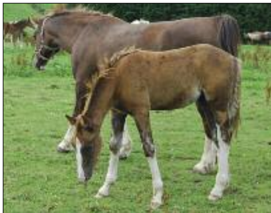
With lot 20 - Filly foal by B. Stepping Stripe with B.Bunny