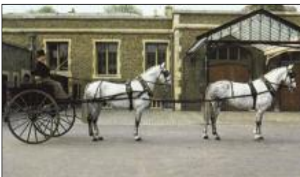
The photo show Arthur Showell driving Montreal and Sydney at the Royal Mews