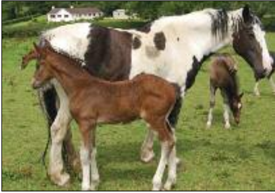
Lot 16 - Rosehall Misty - Colt foal by B. Stepping Stripe