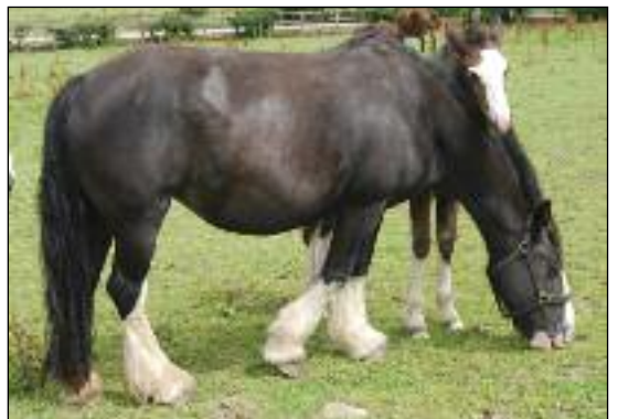
Lot 21 - Rosehall Ebony - Colt foal by Lucky Luke