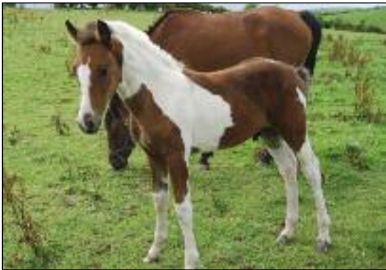
Lot 23 - B. Sheeza Flyer - Colt foal by Randalstown