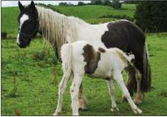
Lot 22 - Rosehall Romany Diamond - Filly foal by Lucky Luke