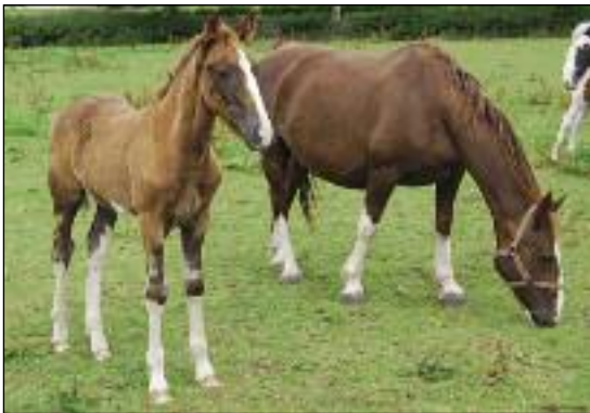
Lot 20 - Rosehall Bunny - Filly foal by B. Steppng Stripe