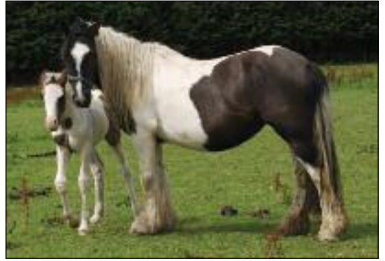
Lot 22 - Rosehall Romany Diamond - Foal by Lucky Luke