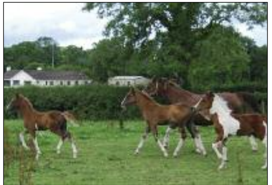
Lot 20 - Rosehall Bunny with skewbald foal by Randalstown and chestnuts by B. Stepping Stripe