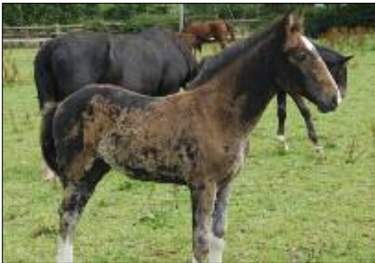
With lot 18 - Filly foal by B. Stepping Stripe