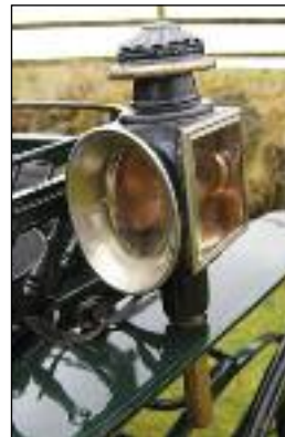
Above photo of Rosehall Romany Queen Lot no.29 The brown/brass set of harness is Lot no. 101