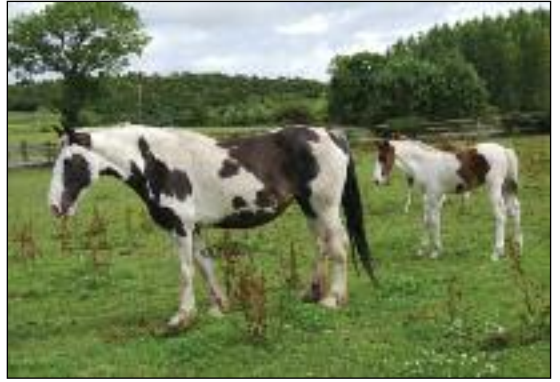
Lot 17 - Rosehall Pamela - Colt foal by B. Stepping Stripe