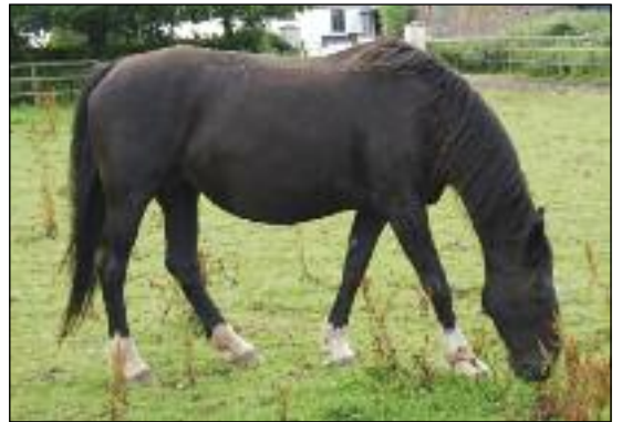
Lot 24 - Rosinante