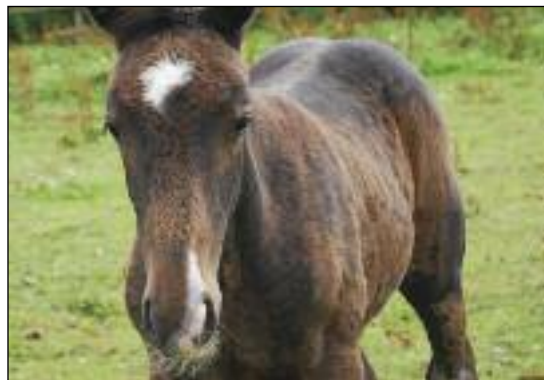
With lot 18 - Filly foal by B. Stepping Stripe