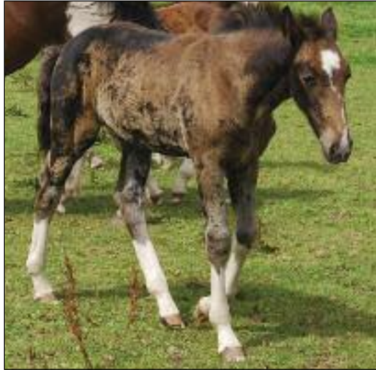
With lot 18 - Filly foal by B. Stepping Stripe