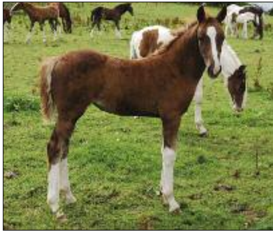
With lot 19 - Filly foal by B. Stepping Stripe