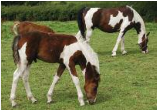
Lot 18 - Rosehall Starlight - in front foal out of B. Sheeza Flyer