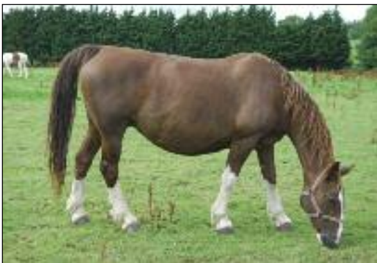
Lot 20 - Rosehall Bunny