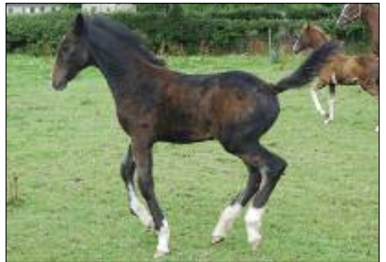
With lot 18 - Filly foal by B. Stepping Stripe