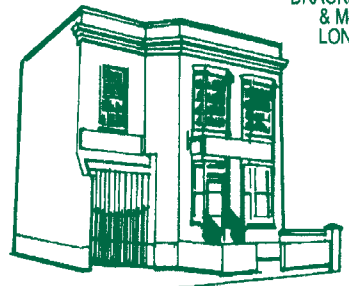
Thimbleby & Shorland